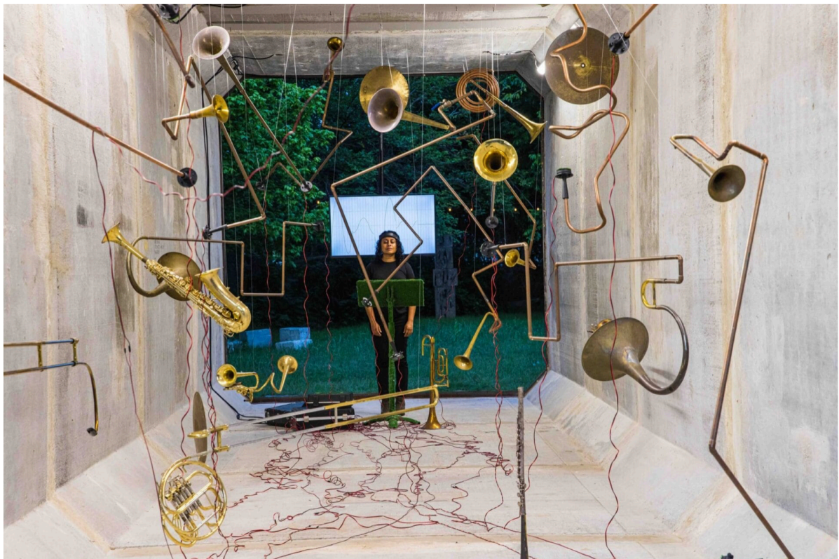
“Sonic Meditation for Solo Performer No. 2,” salvaged brass, electronics, astroturf, EEG brain monitor, video projection