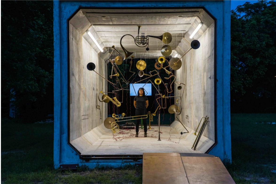
"Sonic Meditation for Solo Performer No. 2," salvaged brass, electronics, astroturf, EEG brain monitor, video projection.

Many therapists advise patients to reconnect with their inner voice, a part of treatment that, as anyone who's tried it can attest, is easier said than done. But what if you could tune into to your internal ups and downs in the same way you listen to a song?