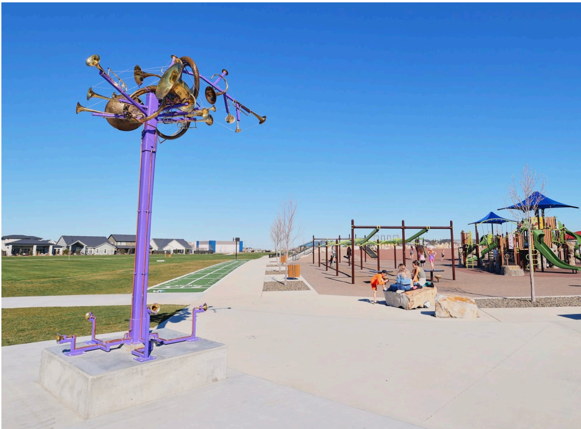
"Fanfare," steel, copper, and brass, 6 x 6 x 18 feet