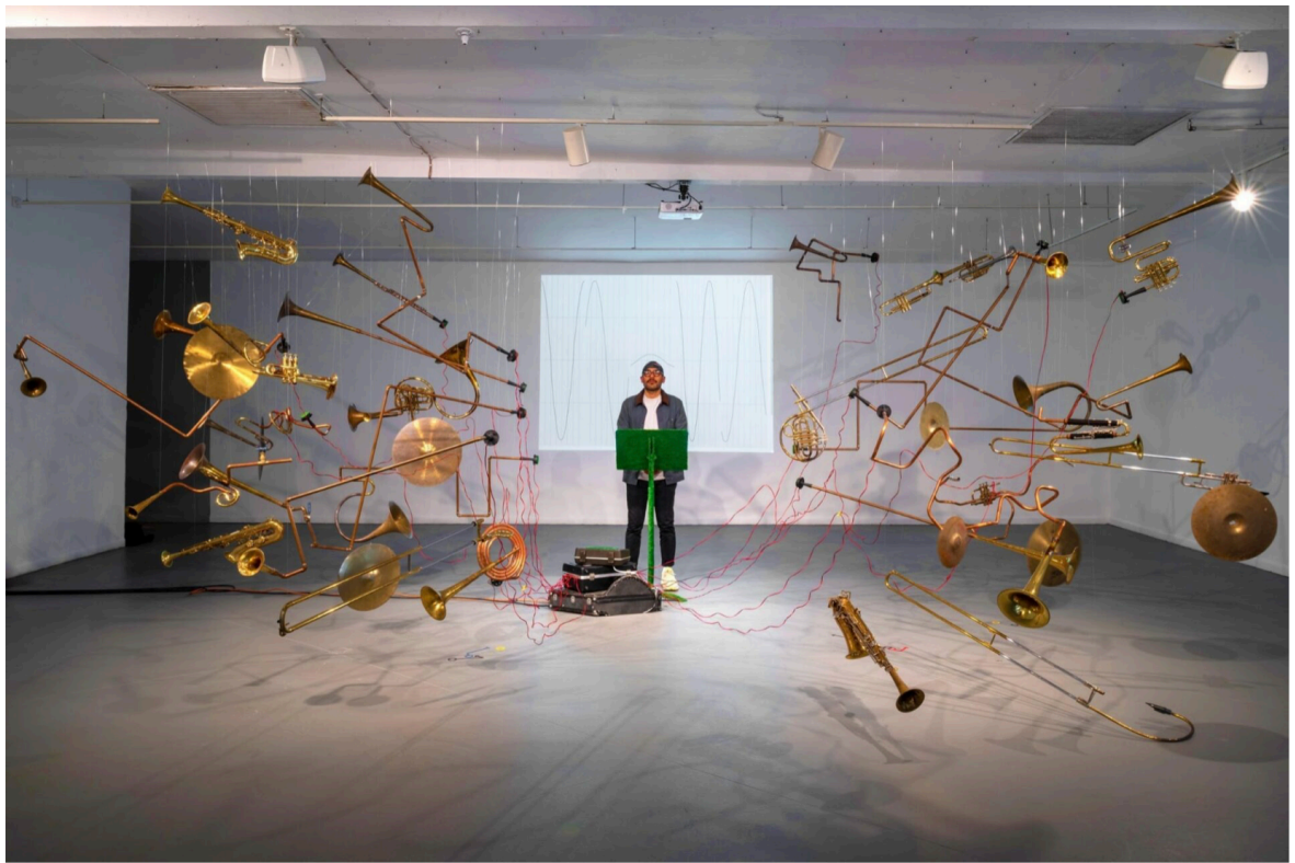
"Sonic Meditation for Solo Performer No. 1 (for Pauline Oliveros and Alvin Lucier)," salvaged brass, electronics, astroturf, EEG brain monitor, video projection