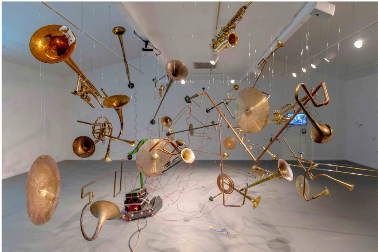
“Sonic Meditation for Solo Performer No. 1 (for Pauline Oliveros and Alvin Lucier),” salvaged brass, electronics, astroturf, EEG brain monitor, video projection