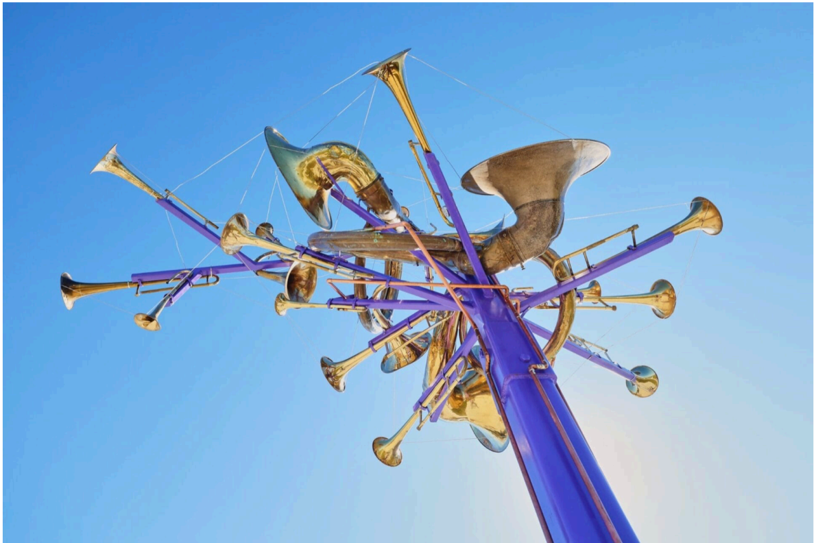
Detail of "Fanfare," steel, copper, and brass, 6 x 6 x 18 feet